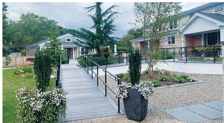
The main entrance of the Heald Center features a large accessible ramp that flows over the koi pond and connects to the blueberry patch.

The Heald Center is now open, thanks to the support of our astounding CCALS community. Contact Ron Hoffman at ron@ccals.org with inquiries.