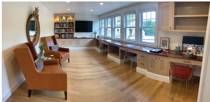
The Holly Ladd library, located in the main building, contains wheelchair accessible seating, dimming lights, and a variety of reading selections.

Turning into the driveway on Chase Road, you hear the sounds of crushed stone under tires and robins chirping softly in the back yard's nature preserve. Whether you are walking or wheeling around the property, you'll have no trouble navigating; all main floors and grounds of the buildings are handicapped accessible. The only places on the property that are not fully accessible are caregiver's rooms, located on the top floors looking over the koi pond and blueberry patch and offering a reprieve from the daily effort of tending to and caring for those diagnosed with ALS.