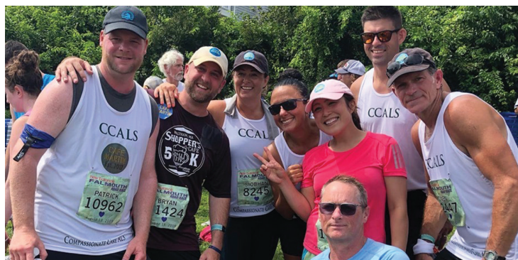
Team Cafe Martin after finishing the 2019 Falmouth Road Race.